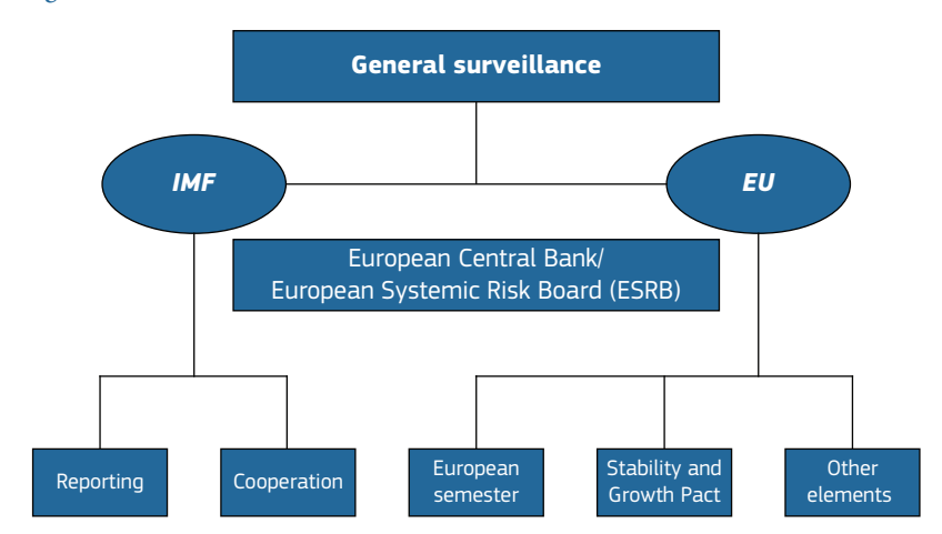
Figure 1: General surveillance

to budget planning data, namely within the European semester, is a useful element. However, this does not help in the case of outright deficit fraud, as in the case of Greece in 2009.