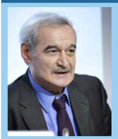
Nikolaos Chountis Member of the European Parliament and its Committee on Economic and Monetary Affairs

The other dimension of the crisis is Europe's heavily indebted banks. One only has to see how much the ECB has lent European private banks on the interbank market to understand that the banking system is being maintained by the liquidity injections of firstly Mr Trichet and now Mr Draghi.